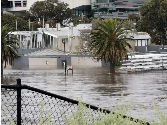
The Maribyrnong in Flood!

Well done and thanks to all who were involved with this massive cleanup!