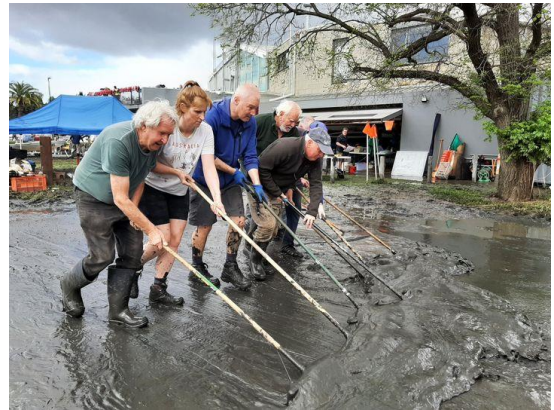
Photo floods at Footscray

This morning we were able to access the club to initiate the removal of MUD, MUD and MORE MUD.