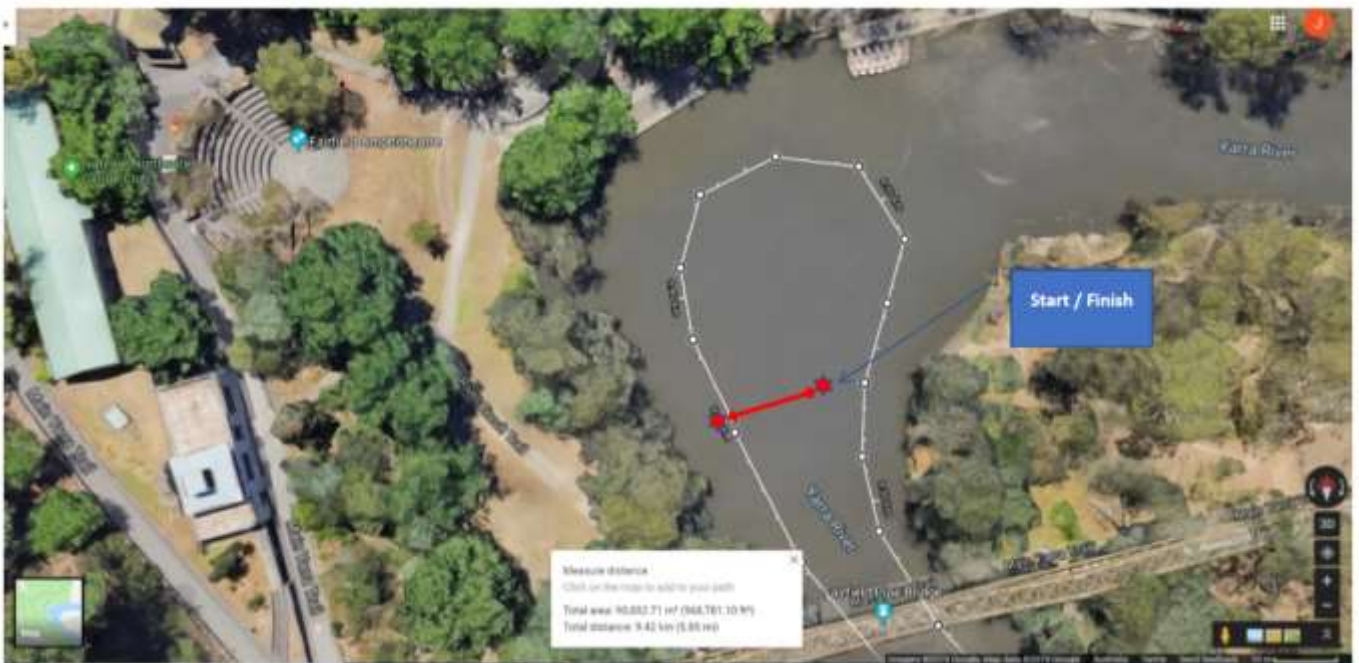
Paddle Victorian Marathon Winter Series Race 3 course map- INCC bowl

All starts face downstream, just before the Pipe Bridge. All finishes face upstream