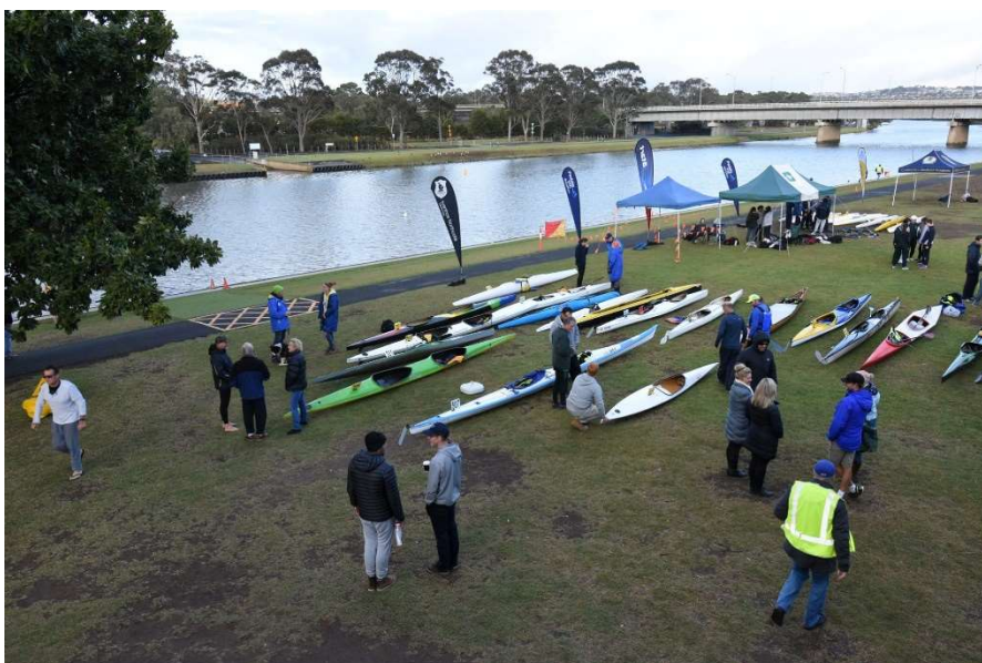
Vic Champs 2019, Geelong